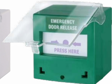
NECP32GBZLB With Backlight & Built-in Buzzer

The Neptune CP32 Resettable Call Point features a resettable operating element that produces no dangerous glass shards, making it suitable for use in high traffic areas, such as schools, shopping malls, or commercial buildings. These Call Points are supplied with double pole changeover contacts and are available with backlight for easy nighttime operation and built-in buzzer for emergency alert.